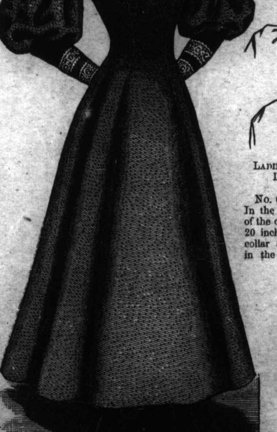
FIGURE No. 276 G.—MISSES' PRINCESS DRESS. FIGURE No. 276 G.—This represents Misses' dress No. 6673 (copyright), which is seen again on page 6. The pattern is in 9 sizes for misses from 8 to 16 years old, and costs 25 cents. For a miss of 12 years, the garment will need 7% yards of goods 22 inches wide, or 3% yards 44 inches wide, or 3% yards 50 inches wide.

LADIES' BASQUE, WITH JACKET FRONT. (COPYRIGHT.) No. 6682.—Another view of this basque is presented at figure No. 271 G on page I. The pattern is in 13 sizes for ladies from 28 to 46 faches, bust measure. For a lady of medium size, the basque needs 3½ yards of dress goods 40 inches wide, with 1½ yard of silk 20 inches wide. Of one material, it requires 6¾ yards 22 inches wide, or 3½ yards 44 inches wide, or 3½ yards 50 inches wide. Price of pattern, 30 cents.