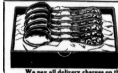
We pay all delivery charges on these Grand Premiums

We are determined to establish a national reputation for Dr. Edson's Famous Life Building Blood Tonic and Nerve Pills and are sparing no expense to secure representatives in all parts of Canada who will help us by introducing this famous remedy to their friends and neighbors. That is why we offer to give away these magnificent premiums.