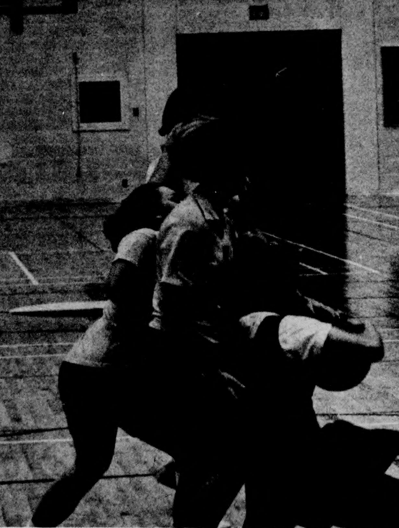
It really isn't long until it's that time again.