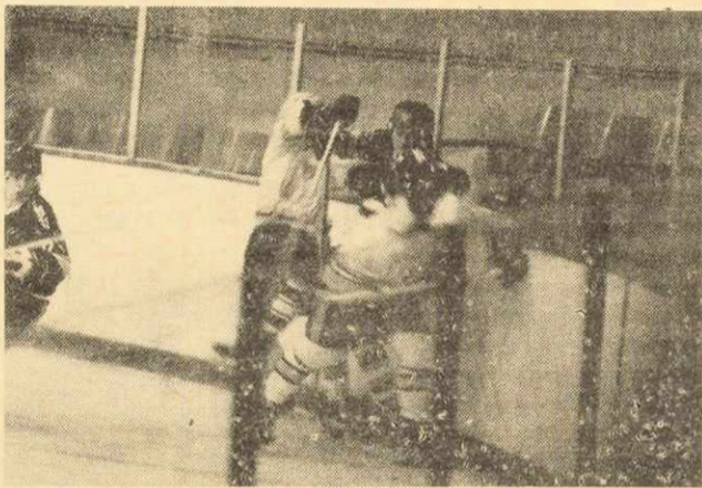
It Got Rougher...

Plan to make this weekend a hockey extravaganza - Support your Tigers in their quest for the championship.