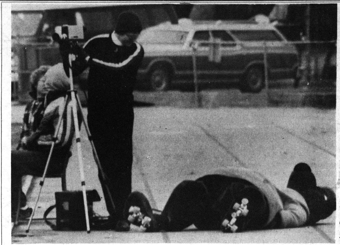
...both the Bear and the Bears fell down on the job.