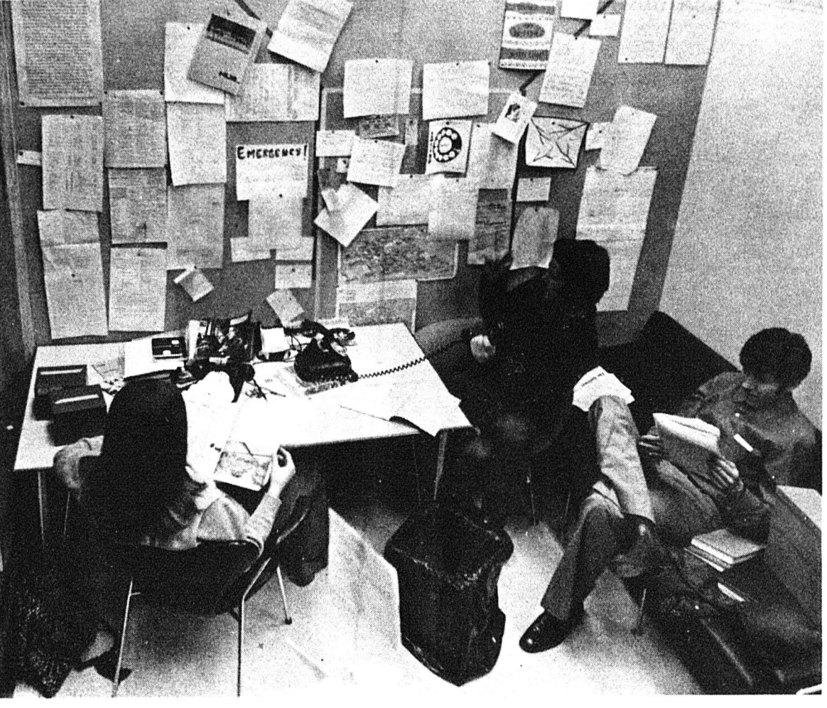
just sitting around...

Dan Moss descrived the ...walk in reaction of most callers to