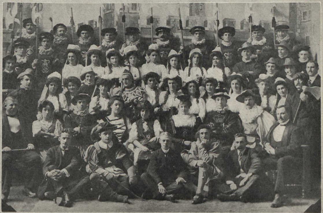
HALIFAX DID LIGHT OPERA WHEN WINNIPEG WAS A FUR-POST.

Pipe-organs made and sold in the country. Here, again, we score heavily. We have one of the best pipe-organ concerns in the world; and several smaller ones. The cost of pipe-organs in Montreal and Toronto would run into not less than $1,500,000. One almost ready to install in St. Paul's Church, Toronto, will cost $30,000. Another opened this