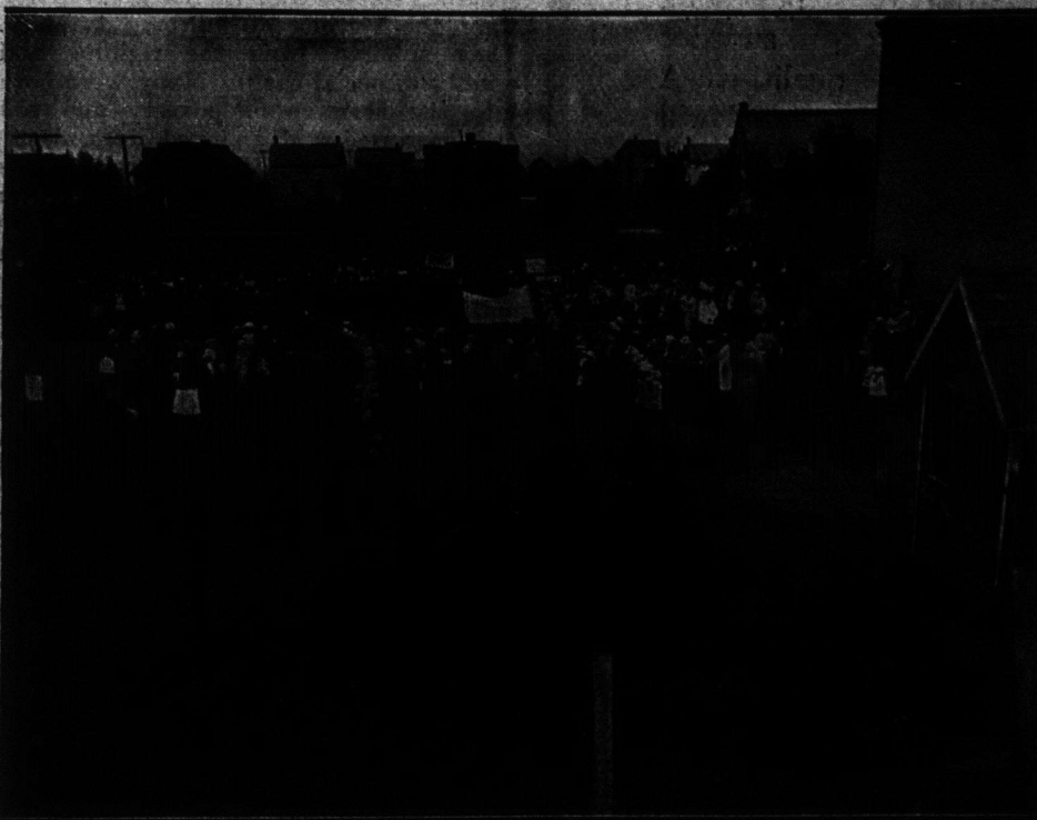
Empire Day at Gladstone, Man., when eleven schools with seven hundred children celebrated the day

If you have examined our list of premiums you will see what advantages we offer to anyone disposed to get up a club, advantages that you should not fail to avail yourself of. You have enjoyed your magazine during the past year—thousands of you have told us so. We can promise you even greater enjoyment for the coming year.