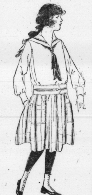
A good dress for the growing girl is this one made of striped and plain materials. McCall Pattern No. 7888, Girl's Simplicity Dress. In 6 sizes, 4 to 14 years. Price, 15 cents. These patterns may be obtained from your local McCall dealer, or from the McCall Co., 70 Bond St., Toronto, Ont.