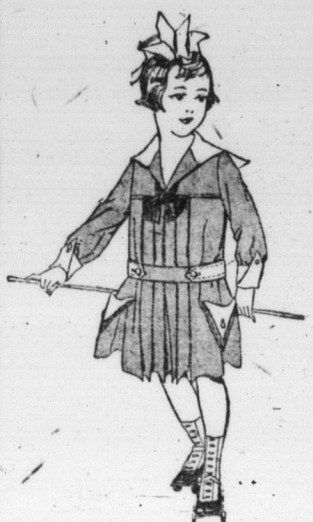
A dress of this type is very smart for the girl, made of tub materials. McCall Pattern No. 7658. Girl's Pleated Dress, in 6 sizes, 4 to 14 years. Price, 15 cents.