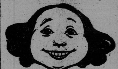
The Pyramid Smile from a Single Trial.

How badly do you want relief? Do you want it enough to go to the small trouble of mailing the below coupon for a free trial of the Pyramid Pile Treatment?