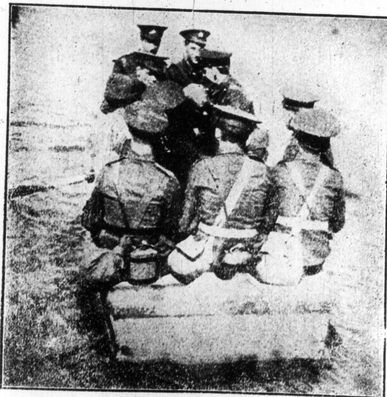
A box-boat joy-ride. British "Tommy's" crossing stream on home-made raft.