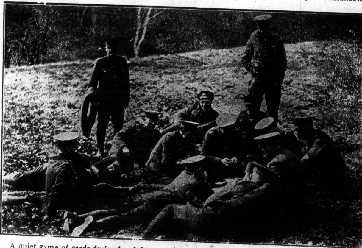
A quiet game of cards during lunch hour. Men of the 97th Battalion at work in High Park.