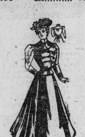
in all wool cheviot serge, colors black, green and Yale blue, braid trimmed and lined throughout, sizes 32 15.00 to 38 bust

Ladies' Pure Wool Serge Dress Skirts, five-gored $3, six-gored gored ..... 5.00 All these Skirts are made in our own workrooms by expert hands. Each skirt is lined throughout and properly faced with good velveteen.