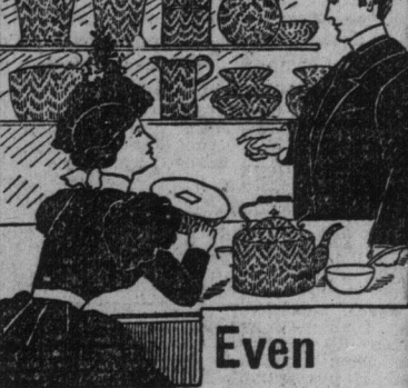
A Good Guesser