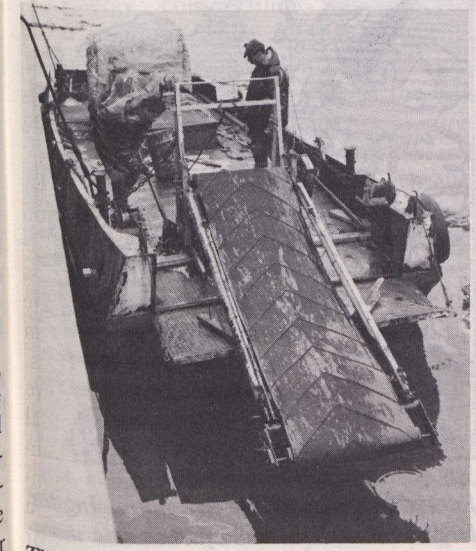
The "slick-licker" mops up oil.

At the Defence and Civil Institute of the Environmental Medicine (DCIEM) in Toronto, work on freeze-drying of foods has contributed to today's availability of camping and travel foods which don't need refrigeration, have long shelf-life and minimum weight and bulk.