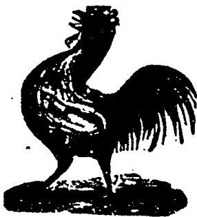
"I CROW OVER ALL."