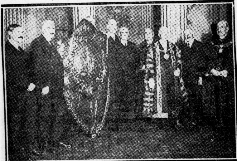
The city of London territorials hand over the Elcho shield, won by their team at Bisley, to the lord mayor for safekeeping.