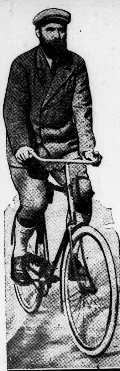
Peter Freuchen, noted Arctic explorer, enjoys a little recreation in Copenhagen. He will try for the pole next year, it is said.