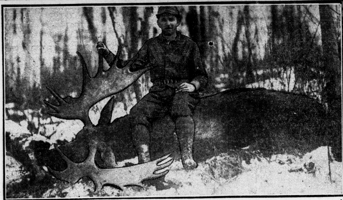
Bob Shawkey, New York Yankee pitcher, with a 1,200-pound moose he brought down in the Maritimes. The animal has a 55-inch antler spread. Babe Ruth was a member of the party.