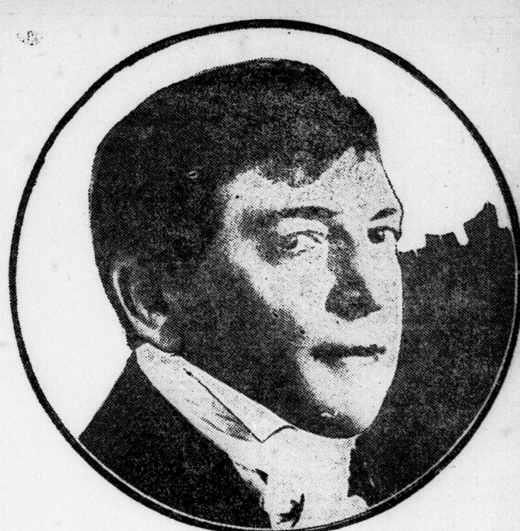
Chauncey Olcott, world-famous star of the stage, who was seriously stricken while appearing at Ann Arbor, Mich.