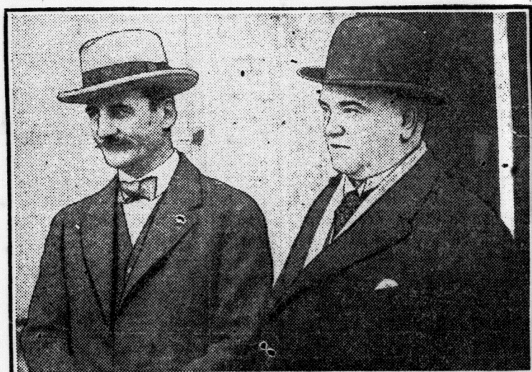
Senator Beaubien and Hon. Rodolphe Lemieux, speaker of the house of commons, sail for a short holiday in Europe.