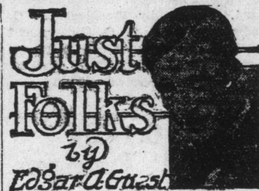
THE POINT OF VIEW.

I'm trying to reduce my weight. I'm eating many things I hate, attempting to grow thin; by following the diet game I hope to shrink my ample frame, and lose my double chin. I've cut out bread, and butter, too, and all things sweet, and liquid glue, and milk and clotted cream; and while I hope to lose a ton, the stunt I'm doing is no fun, existence is a scream. Oh, others seek the groaning board, and whack off victuals with a sword, and eat whatever they please; and they may fill themselves with jam, indulge in gravy, pie and ham, and forty kinds of cheese. And I alone must sadly browse on fodder that was meant for cows, and shun the tempting things; the dinner bell for me no more brings tidings of good grub in store, it jars me when it rings. The dweller in the crowded flat, the artisan, the plutocrat, may eat what he or they wish; but I must boil a mess of straw, or feed on germproof prunes and slaw, and cheap denatured fish. And while the mash of bran is mixed, my eyes are on my waistline fixed, and fixed thereon in vain; I do not lose a single pound, I starve where wholesome pies abound—is weight reduction sane?