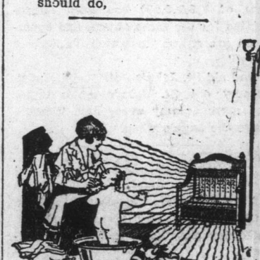
FOR LITTLE TOTS ON CHILLY MORNINGS.

The man on the mountain sees more and may know Much that is missed by the man down below. And I in my station may well govern By the light that I have and the path I can see; But no one should say what another should do.