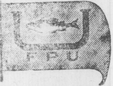
(To Every Man His Own.)