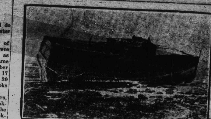
Tossed about for four days on Lake Erie, within twenty miles of home port, Dunkirk, seven men were saved when their fishing tug, Helene, was thrown high and dry on the beach at Angola.

"All through your observations," the lecturer declares, "you get the idea that these creatures are sensible, but all the time these ideas are being destroyed. They are doing only those things which are inherent."