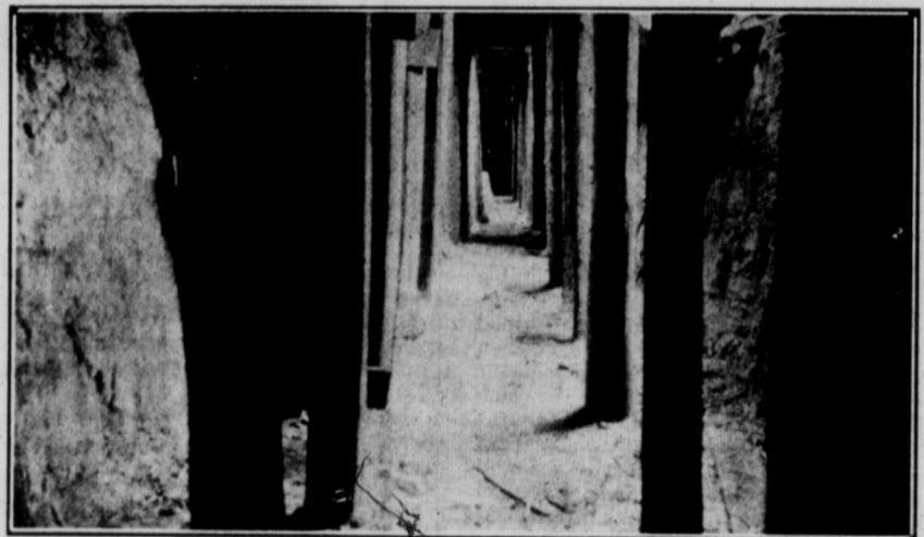
Root cellar used successfully by the Patmore Nursery Company, Brandon, for a number of years. A full description of the construction of this cellar appeared in the issue of The Guide of Sept. 1, page 9.

you want to get rid of. If you give that to the cow in the morning she does not like it, but if you give her that rough straw when she is outside around a stack she will eat more of it and make better use of it, and if you give it to her at night, she will eat more or less of it, and what is more, pay you well for it.