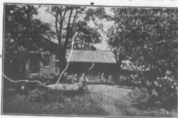
A Cozy Old Homestead in Prince Edward County

A few plants do much to make a house homelike. They can be easily raised. One of the most important things in drainage. If tin cans are used in which to grow them, punch the bottom full of holes with a spike. Then put in an inch layer of coarse gravel, pieces of coal or broken crockery. The regular flower pot has a hole in it but put in the gravel, deal of organic matter—one-third leaf mould and two-thirds soil makes a good mixture. Well rotted manure can be used in place of the leaf