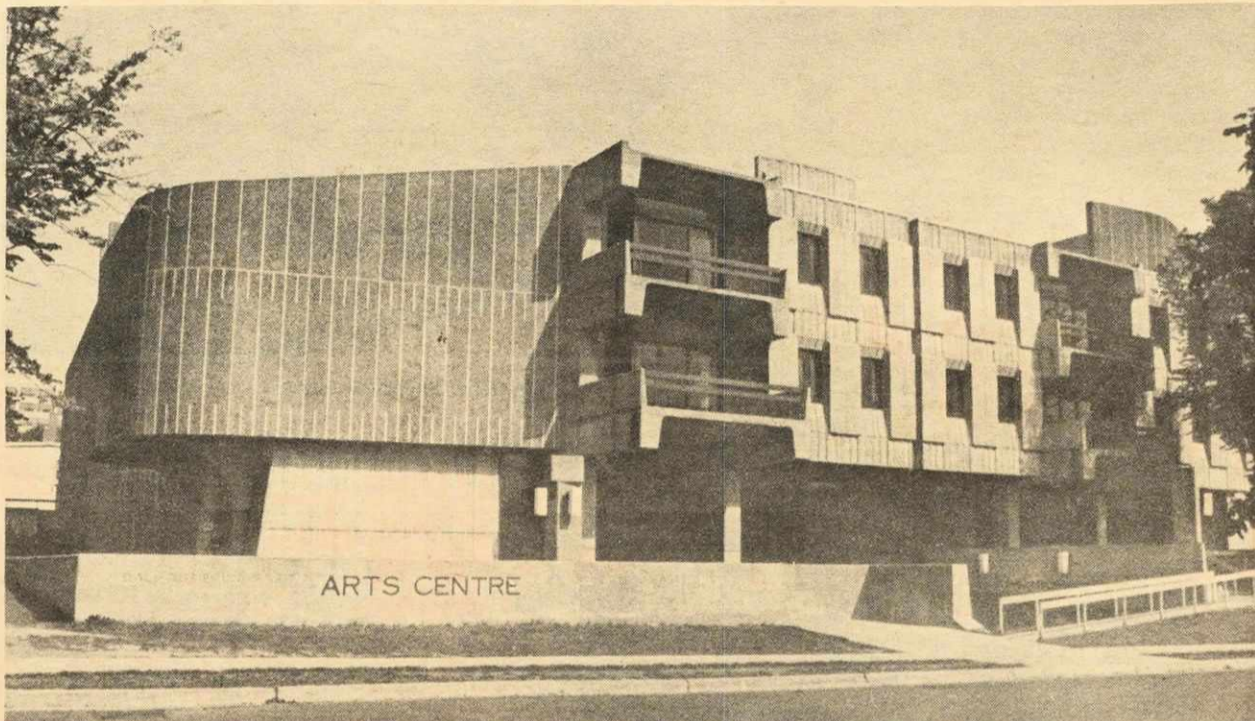
Dal Photo / Douma