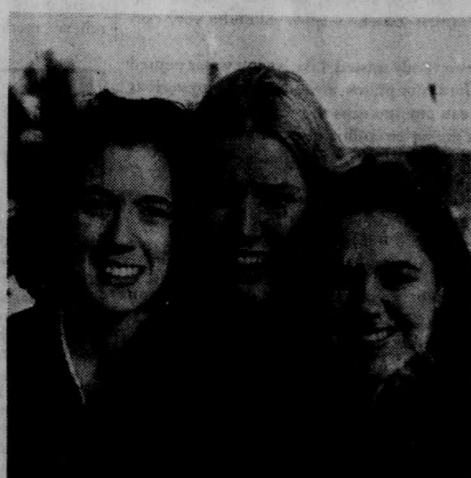
THE GODDESSES HEAVEN (1000) "We didn't make any, we're already perfect."