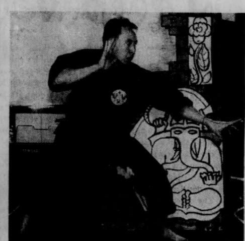
KWANG ZU MARTIAL ARTS (5) "It would definitely be beating up my profs, that's a big problem."