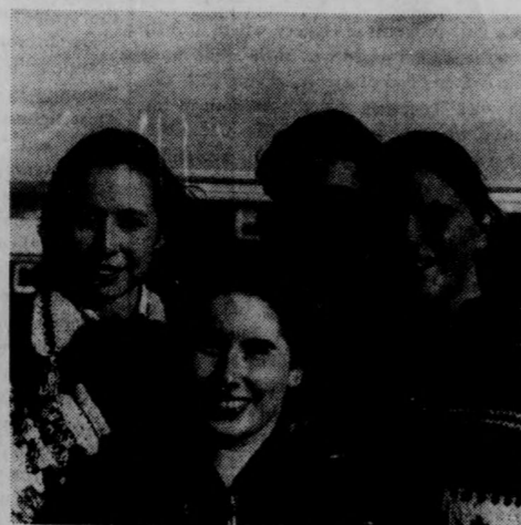
THE PROFESSIONAL GIRLS MASTERS IN ALL DEGREES "Late for class because we got stopped for this viewpoint question."