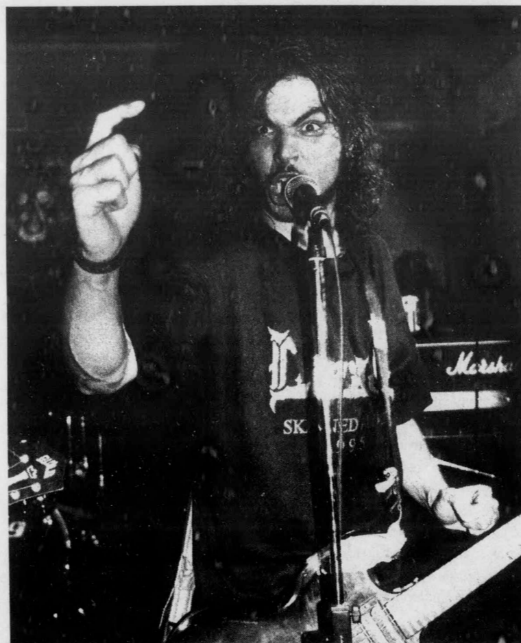
Who needs a picture of SNFU anyway - we have Lizard!!!

It was also nice to see them play beyond 11:00 because normally if a show is at the Farmer's Market it has to be cut off at 11:00 due to by-laws. But since the warehouse is out in the