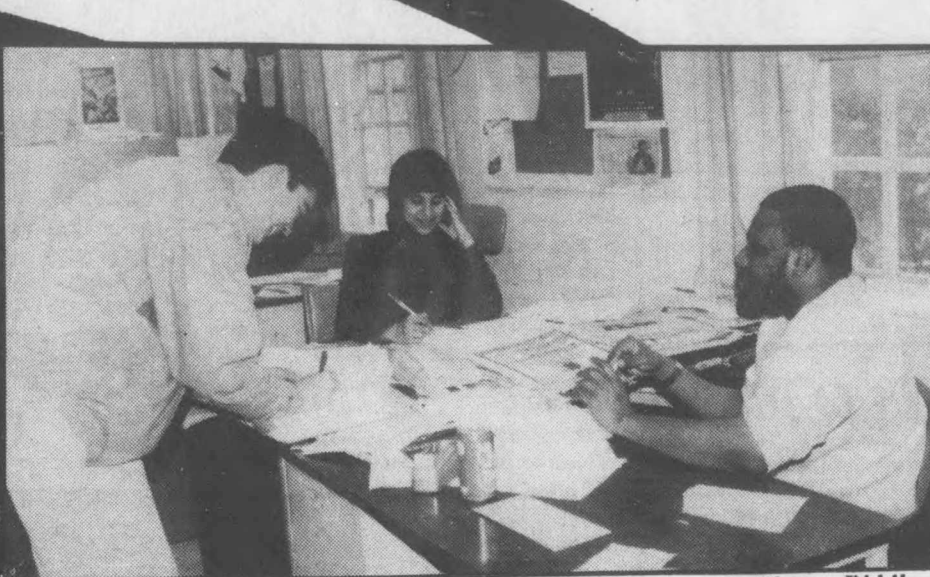
"And Then He Put His Head Between Them and Went Bbbll Bbbbll...!!" Yes It's Non-Stop Fun at the Bruns News Desk