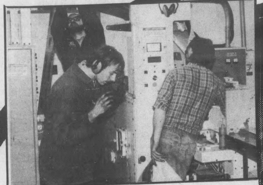
Printed With Flair By Henley's in Woodstock