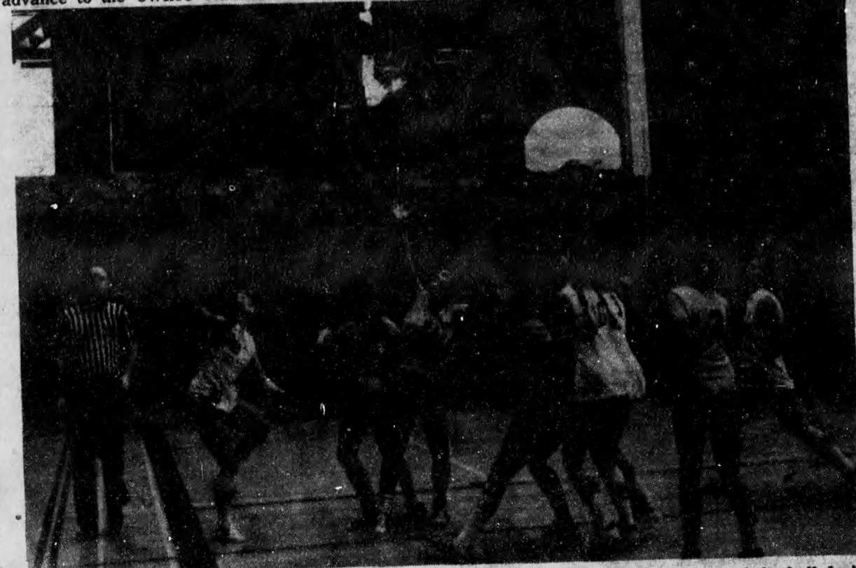
It seems by the photo that every member on both teams seem to be awaiting the return of the ball during Bloomers play this season. This weekend, Saturday at 1:00 p.m., the Bloomers will be playing host to the winner of the Dalhousie Tigerettes, St. F.X. X-ettes game for the AWIAA championship. The winner advances to the CWIAU National finals out west.

Come out and cheer for the Red Bloomers Saturday at 1 p.m. in the main gym. They want your support!