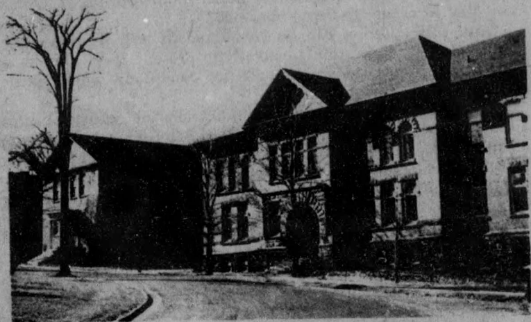
SCENE OF "OPEN HOUSE" NOVEMBER 19

Engineering Week is quickly approaching. For the Engineering faculty, this means guest speakers, a formal dance at the Eden Rock Motel, a banquet, Open House, the Senior Engineers Party, Sports Night and so on. However, to the rest of the students at U.N.B. and even to some Engineering students themselves Engineering Week's most important event should be 'Open House'.