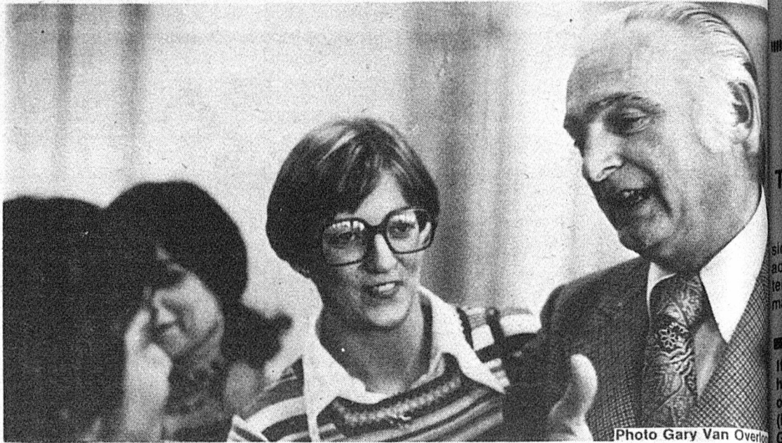
Bert Hohol, advanced education minister, chats with "public" after being grilled at NSD forum because of his proposed foreign student fee hike.