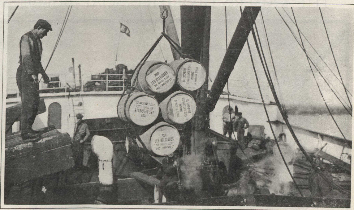
Barrels of flour from the farms and mills of Nova Scotia going into the hold of the Tremorvah.