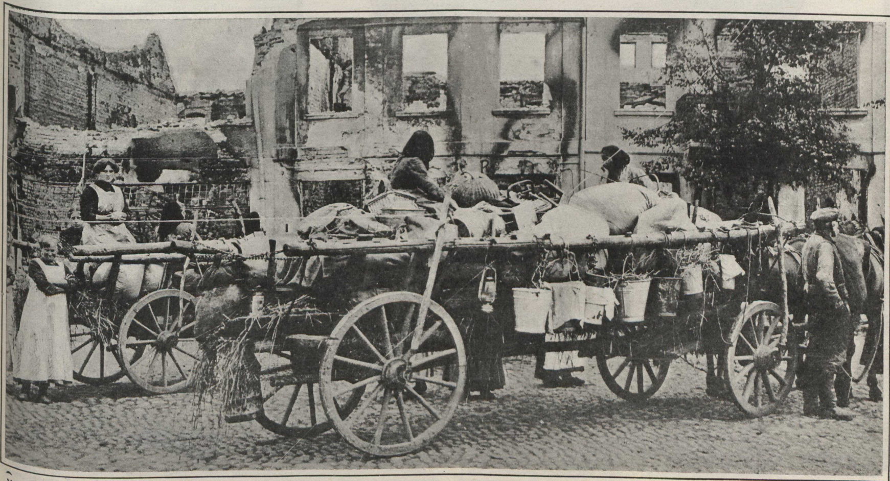
When the Russians got through with Soldau, near the border of Poland, it looked considerably like some of the Belgian towns left by the Germans. But Soldau was a hostile belligerent town and was subject to the rules of warfare.