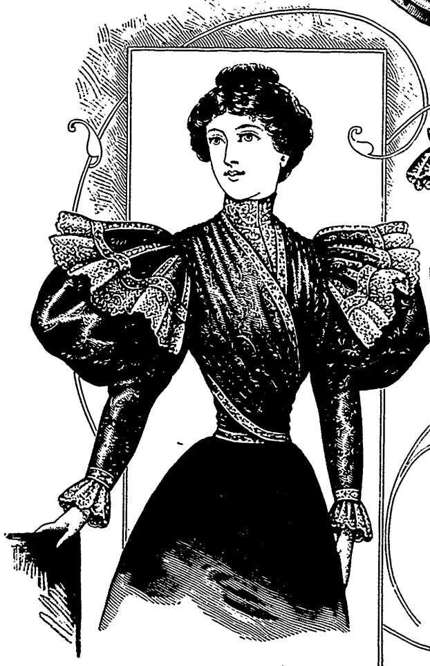
FIGURE No. 197 T.

Ribbon, flowers and white embroidered chifon form the trimming of the straw hat.