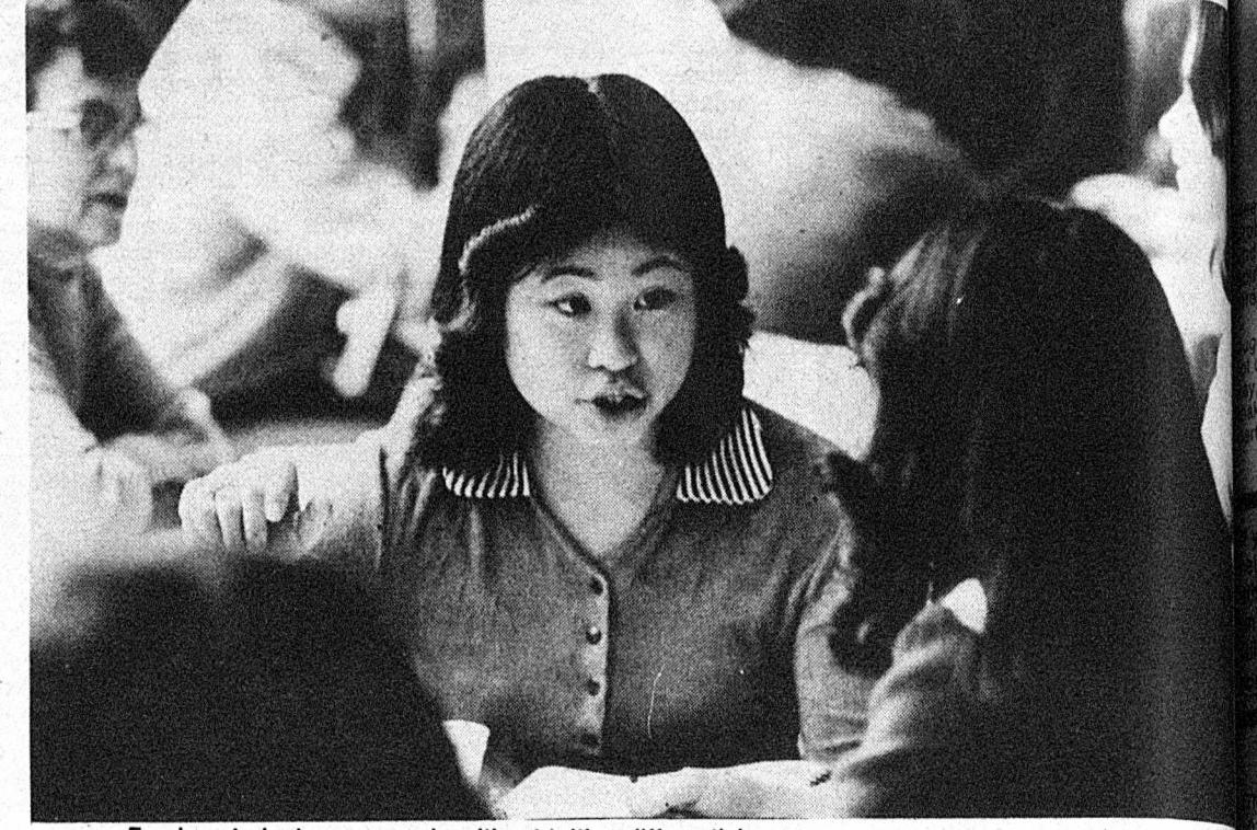
Foreign students may remain without tuition differentials. Foreign students may keep their places on campus with Canadian students, following a Board of Governors decision Friday to reject a proposed two-tier tuition system.

Forest concluded by saying the Senate decided that "for a few