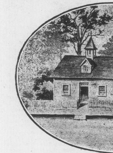
FIRST ST. ANN'S CONVENT, VICTORIA, 1853.

a thanksgiving day for this faithful handmaid of Christ, who obedient to the rule punctually followed for forty years, as usual rose at five, and at the morning service made a public renovation of the vows contracted at the age of seventeen.