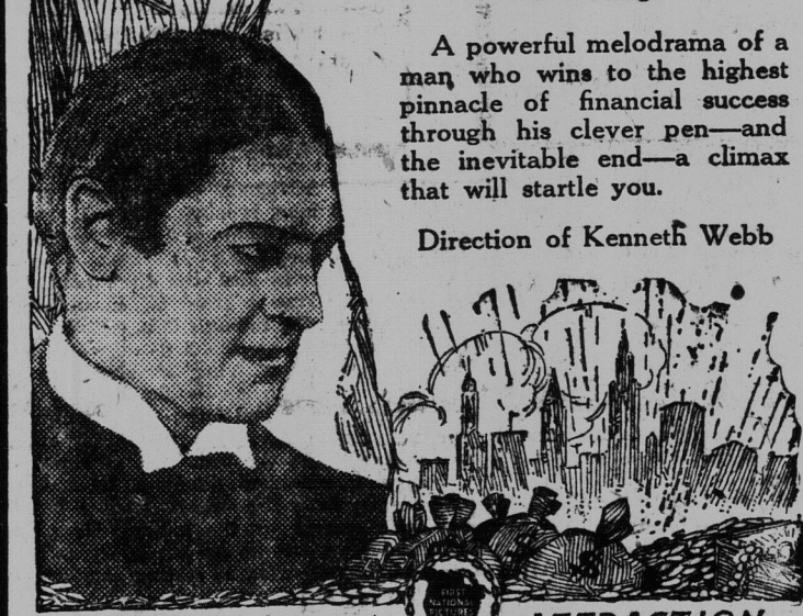
A "FIRST NATIONAL" ATTRACTION