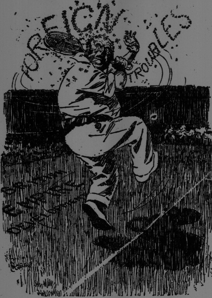
John Bull—"Drat the little pests! They put me right off my game!" —The Passing Show (London).