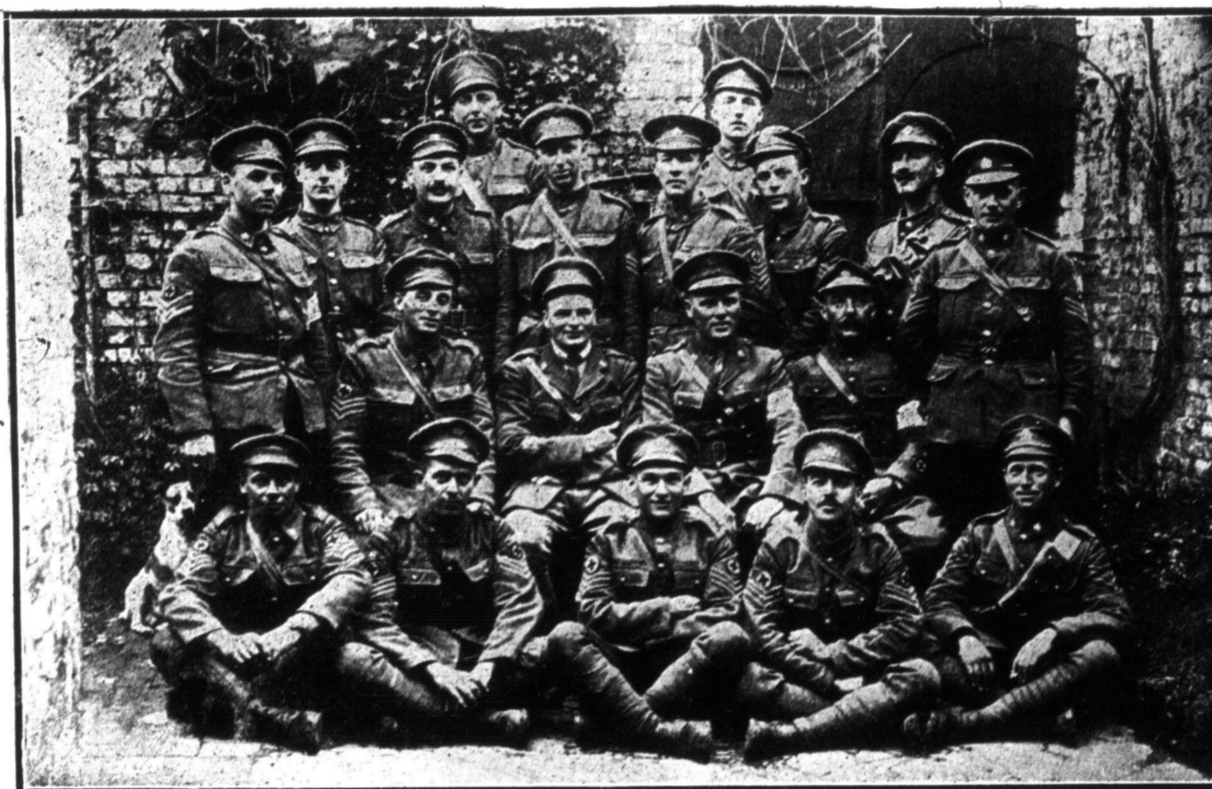
No. 2 Canadian Field Ambulance Sergeants after the battle of Vimy Ridge.