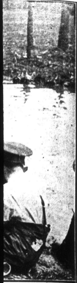
pressed into service.