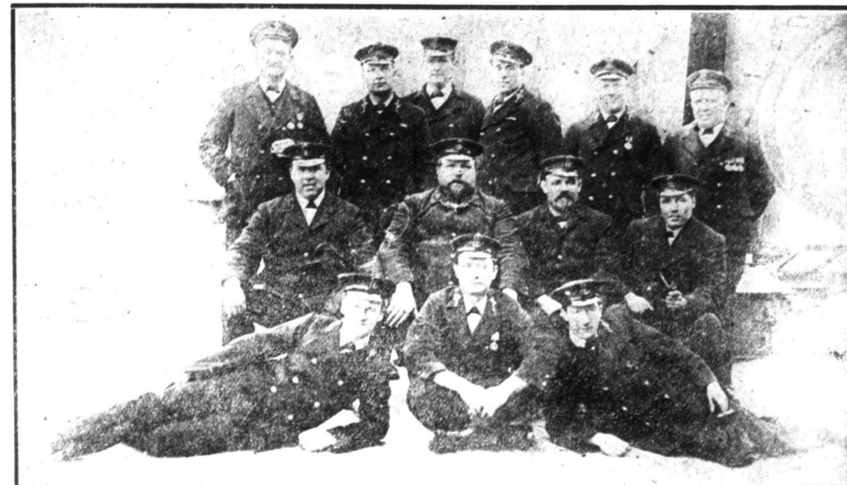
Sailors of H.M.S. Cochrane, who have a service total record of three hundred years.