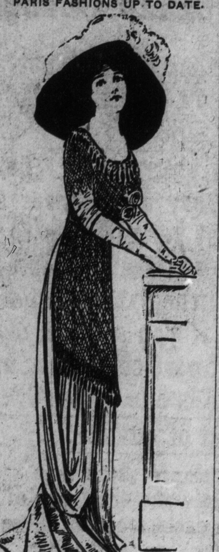
Chantecler satin gown; black jetted

came a change in the social era. To come from the rich warmth of tapes-tries and Georgian walls to the beaucame a change in the come from the rich warmth of tapestries and Georgian walls to the beautiful, pure whiteness of the Adams decoration, and be expected to breathe into it the same lively atmosphere was impossible. The Georgian merriment could not survive the change. It had to the White is the most maddening was the most rapid, killing the germ to die. White is the most maddening in twenty-four hours, while maroon of hues. It will destroy the eyesight in