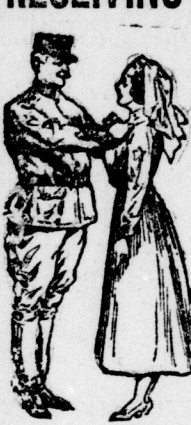
RECEIVING WAR CROSS

If a woman is borne down by pain and sufferings, by nervousness or dizzy spells, by headache or backache, "Favorite Prescription" should be taken. It can be had in tablet form as well as liquid at most drug stores. Send to Dr. Pierce's Branch at Bridgeburg, Ont., for a free trial package of tablets.