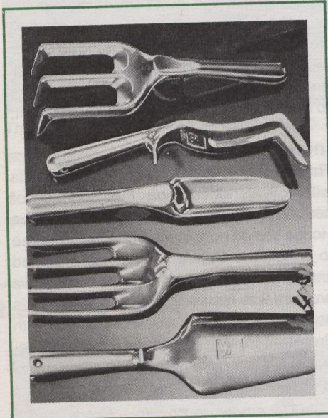
Allen Simpson Marketing and Design's garden tools are cast from a rust-free, high-strength aluminum alloy in a choice of finishes.

pieces, mouldings and accessories; • Colonial Elegance Inc. — wooden staircase components, curtain rods, plate rails, mailboxes and paper towel holders;