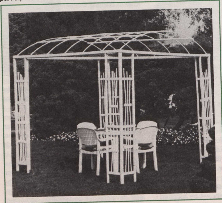
Attractive maintenance-free, high-strength PVC garden furniture is manufactured by Niagara Triad Canada.

• Xypex Chemical Corporation — concrete waterproofing compounds, hydraulic cement compound in kit format.