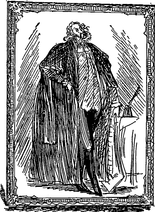
AS REPRESENTED BY THE COURT PAINTER.