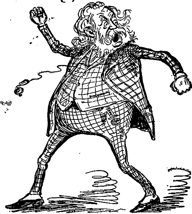
AS REPRESENTED BY THE SENATOR HIMSELF.

"On whom shall we call," exclaimed an orator, "to cure the evil effects of bad legislation?" "On a doctor of laws," cried one of the auditors.