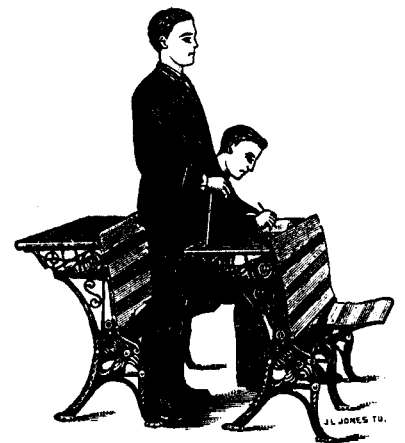
BCT AUTOMATIC" SCHOOL DESK. The latest and best.

PRESTON, - ONTARIO. Successors to W. STAHLSCHMIDT & Co. Manufacturers of Office, School, Church and Lodge Furniture.