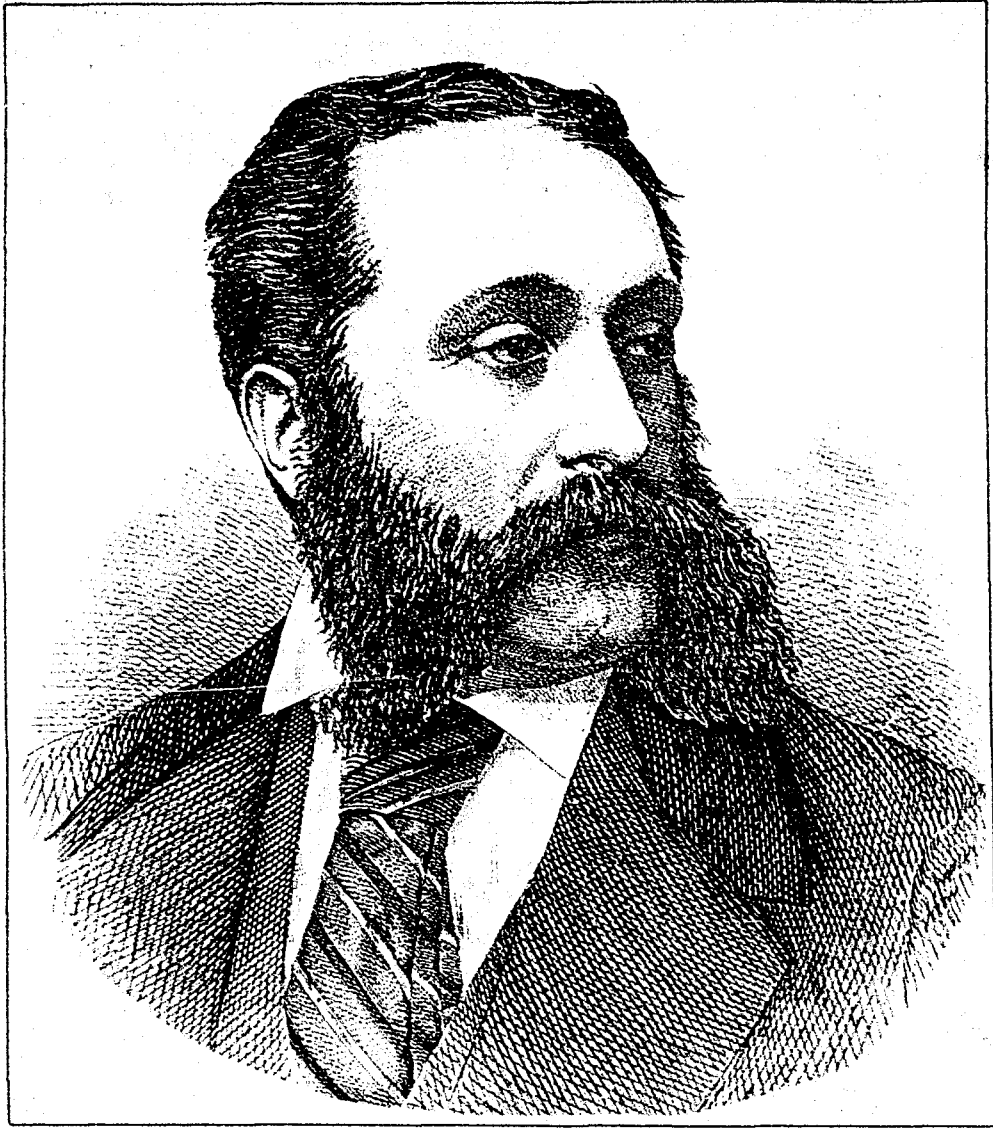
No. 312.—HON. THÉODORE ROBITAILLE, THE NEW LIEUT.-GOVERNOR OF QUEBEC.