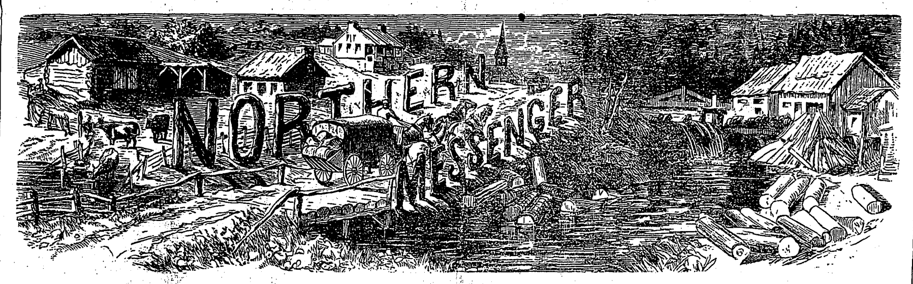
DEVOTED TO TEMPERANCE, SCIENCE, EDUCATION, AND LITERATURE.