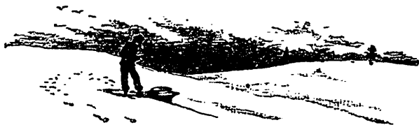
A MIDLAND TRAIN SNOWED UP, NEAR DENT.

night the drifts entirely blocked the up road. We then worked the traffic for a short distance on the down line till an engine, which had been taken from its train to make a run at the drift, bedded itself so fast in the snow that it could not back out. From