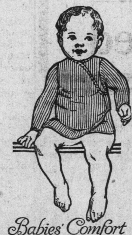
Babies' Comfort UNDERWEAR

Dainty conceits in a lot of new and stylish Bows. Pretty Plaids, Black and White, and a pleasing lot of plain shades very neat. Reg. 25c. Friday, Saturday & Monday 20c.