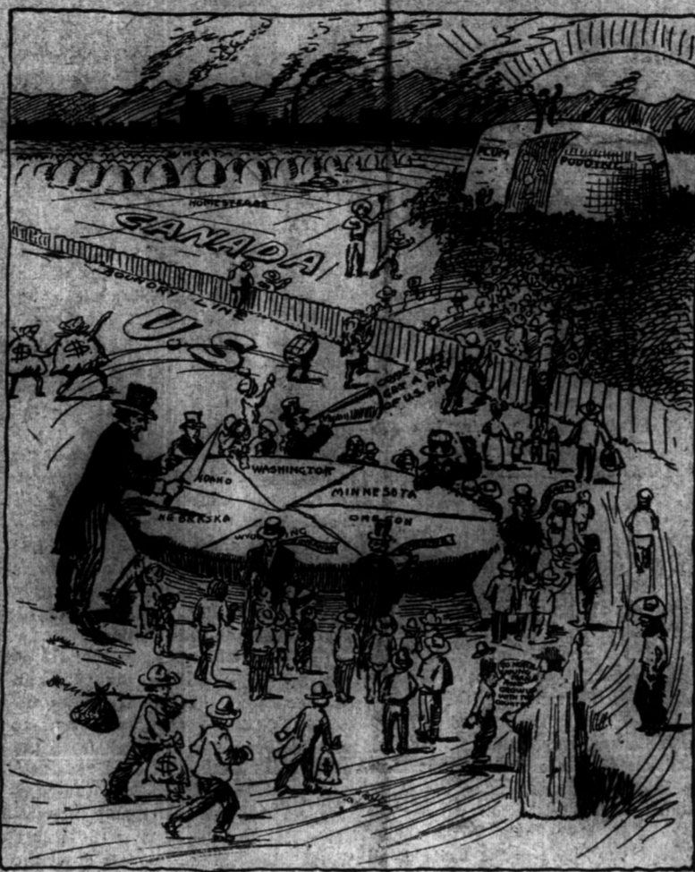
Uncle Sam (U.S.) as the ball who man has ever a strong campaign for the farmer, but Western Canada's golden opportunities have proven too alluring for the farmer and he is here to stay.

General Bernhardt said: "Our next war will be fought for the highest interests of our country and of mankind. World power or downfall will be our rallying call."