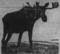
Antlers taken from a bull moose in the forests of Ontario.

In September and October during the rutting season, the hunter occasionally bears the sounds of terrific combat between those giants of the forest, the bull moose. With their formidable antlers these creatures can snap a young birch tree like a piece of matchwood, and although it is only rarely that the bull moose will attack a man, if he does so the man has little chance unless he is aided with his blow-pipe rifle. The other day on an island in the St. Lawrence, a pair of locked moose horns was found at the scene of a combat. They had evidently been fighting when the antlers became entangled and, unable to extricate each other the two animals died there of starvation, their