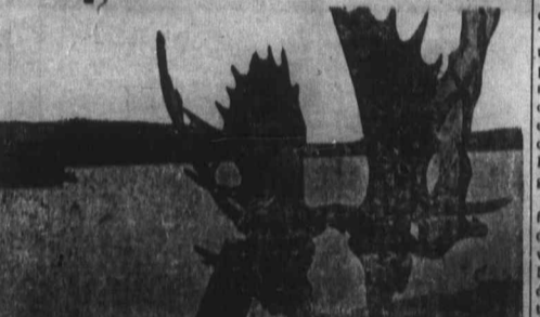
The locked antlers.

In September and October during the rutting season, the hunter occasionally bears the sounds of terrific combat between those giants of the forest, the bull moose. With their formidable antlers these creatures can snap a young birch tree like a piece of matchwood, and although it is only rarely that the bull moose will attack a man, if he does so the man has little chance unless he is aided with his blow-pipe rifle. The other day on an island in the St. Lawrence, a pair of locked moose horns was found at the scene of a combat. They had evidently been fighting when the antlers became entangled and, unable to extricate each other the two animals died there of starvation, their