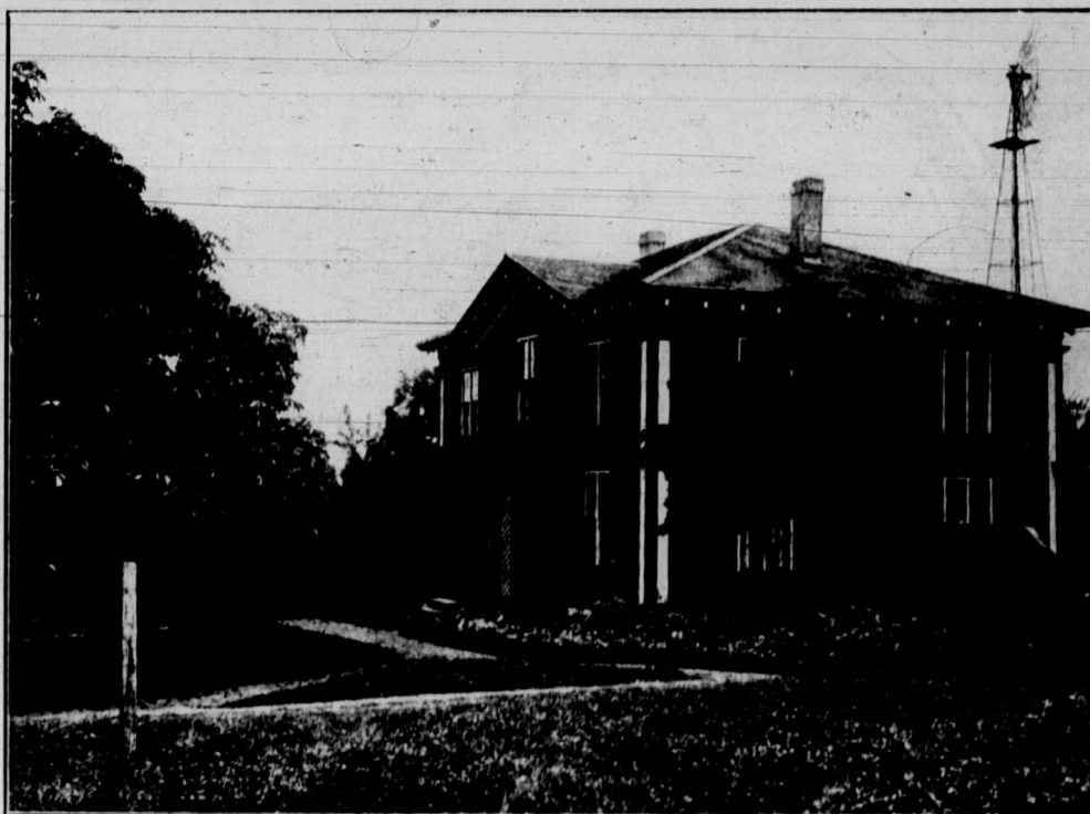
BIRTHPLACE OF HON. R. L. BORDEN, GRAND PRE, NOVA SCOTIA