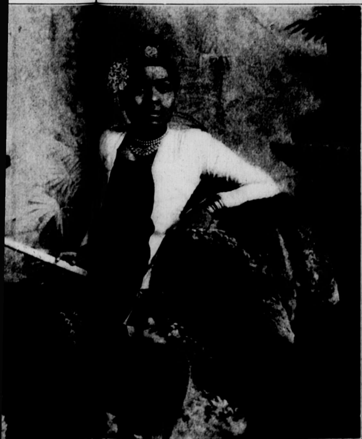
BURMESE SUBJECT KING GEORGE she holds a large as are smoked by many of the Burmese women.