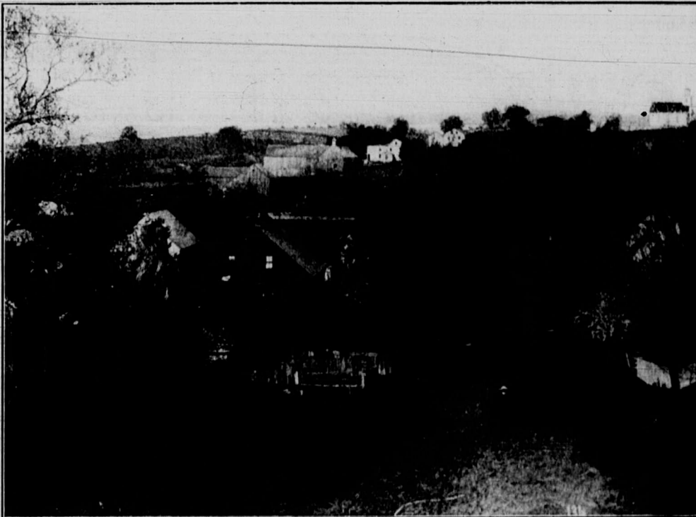
VILLAGE OF GRAND PRE, NOVA SCOTIA