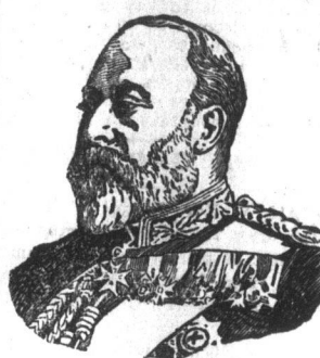
KING EDWARD VII.

Who Suffer From NERVOUSNESS, SLEEPLESSNESS, RHEUMATISM, NEURALGIA and DYSPEPSIA.