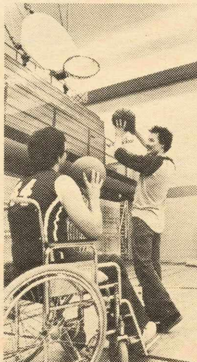
Services to handicapped