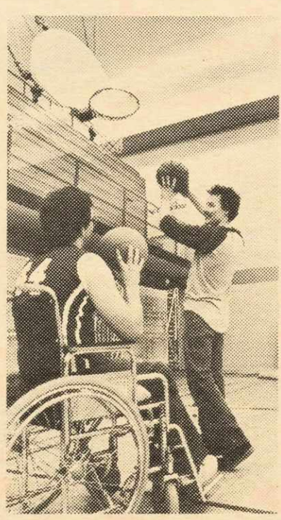
Services to handicapped