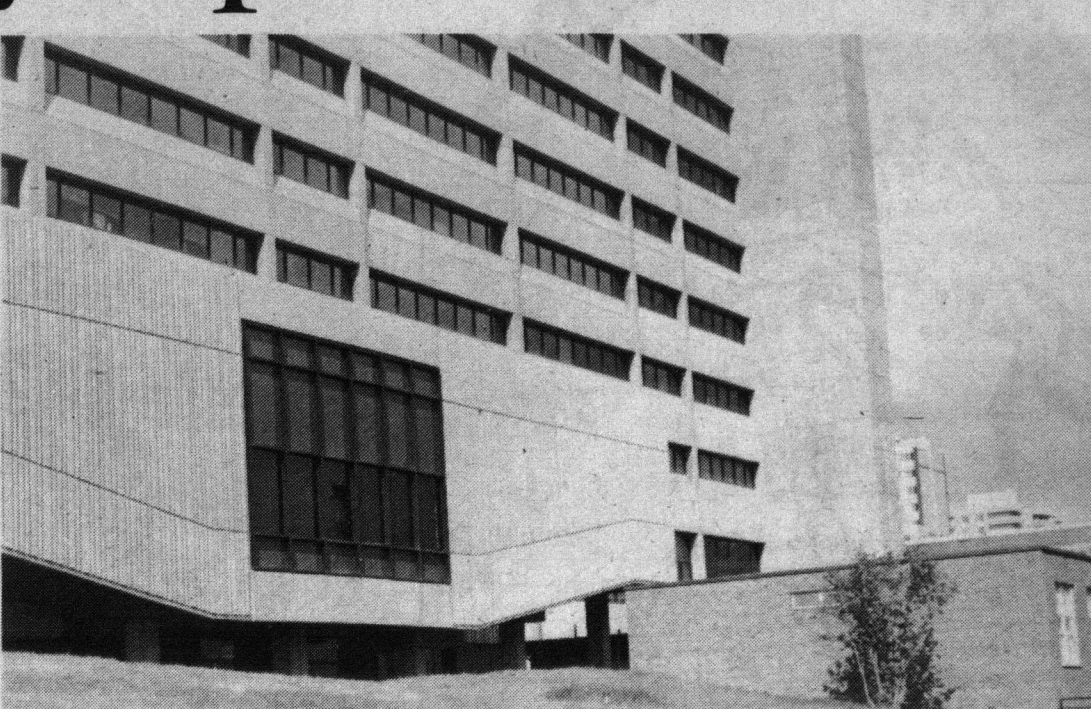
Medical Sciences was the vent of some controversy last week as the Edmonton Journal reported some noxious

The renovations involved giving each fume hood its own separate exhaust in order to avoid dangerous combinations of gases, in compliance with government continued on page eight